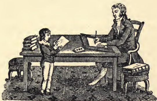
A Kind and Good Father